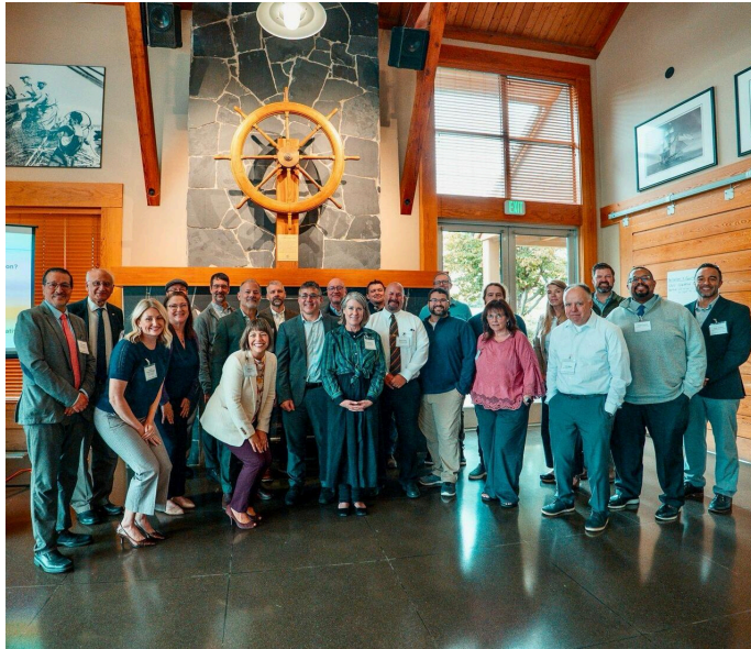
NW Education & Workforce Council and presenters gather at Squalicum Boathouse in Bellingham