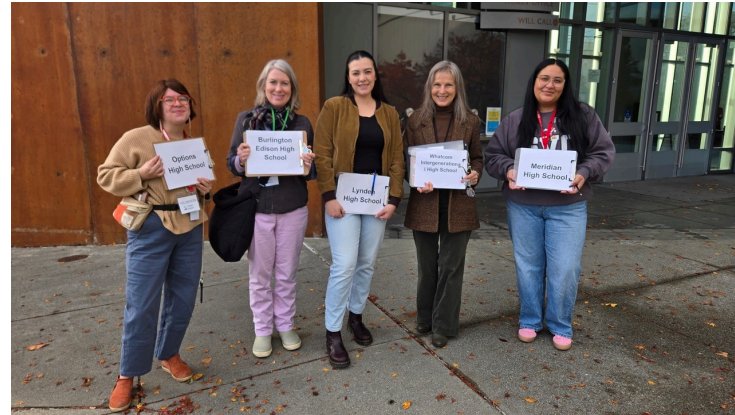
Volunteers waiting for students to arrive at the Learning with Leaders event at Skagit Valley College

Students learned about Computer Numerical Control (CNC) Machining, Computer Aided Design (CAD), and participated in an accelerated ping pong & pipe activity led by knowledgeable SVC instructors and Janicki Industries!